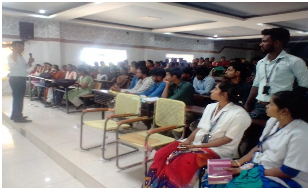
Chief Guest Interacting With Our Student