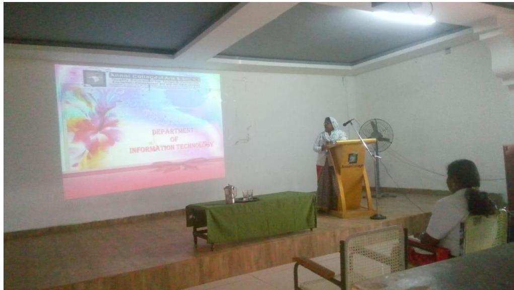
Department of Information Technology