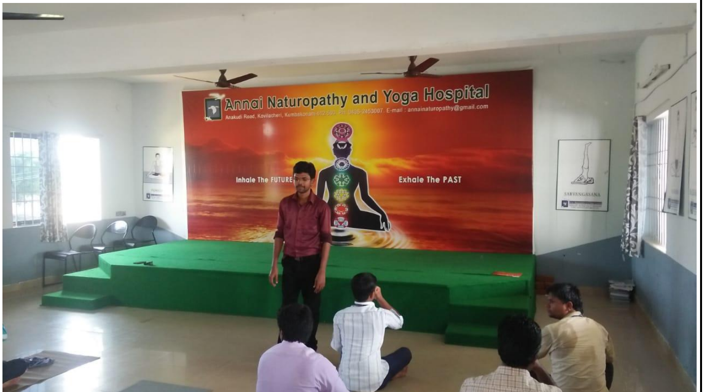
YOGA master instructing yoga to our faculty members