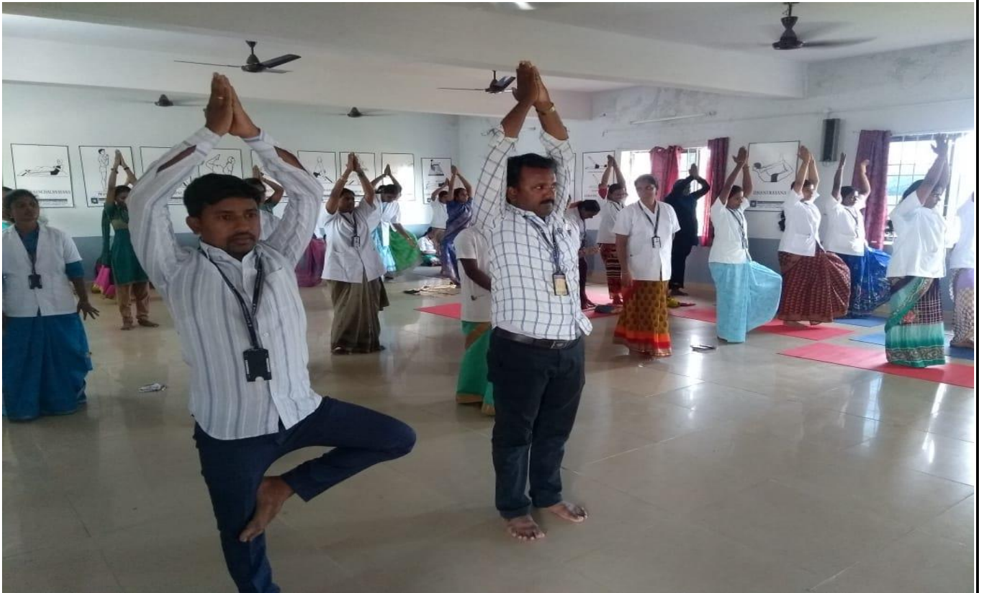
Our faculty members practicing YOGA