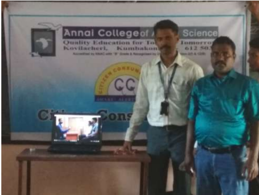
Short film and videos related to consumer awareness were displayed