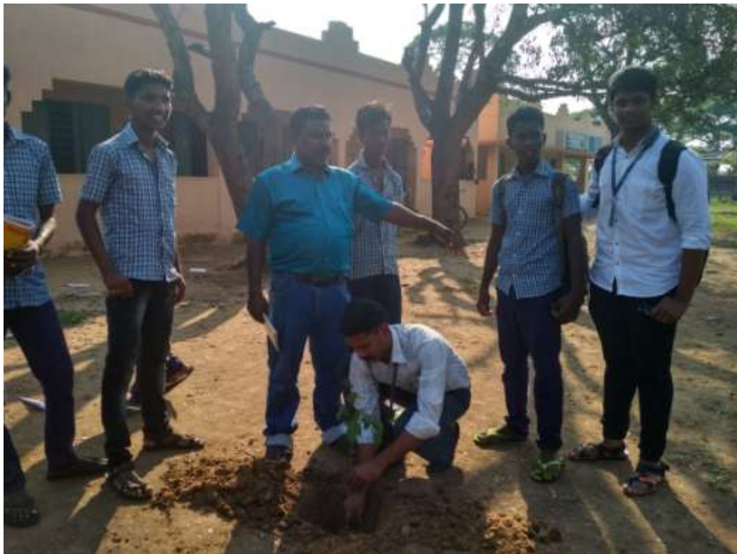
Planted along with the CCC members and school students within the School campus